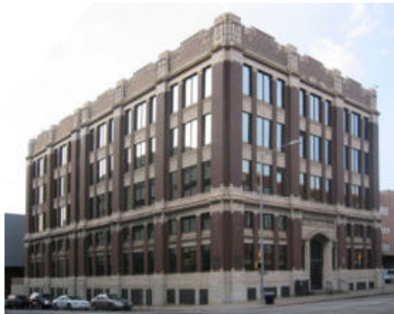
Old Birmingham News