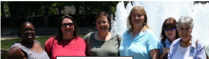
The Research Crew