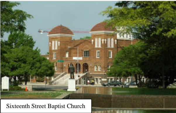
Sixteenth Street Baptist Church