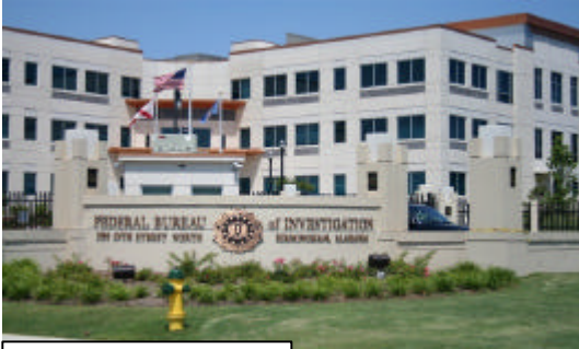
Birmingham's FBI Office