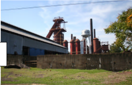
The terrifying Sloss Furnaces property. And this isn't even the half of it.