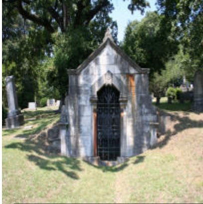
The cemetery where victim 1 is found.